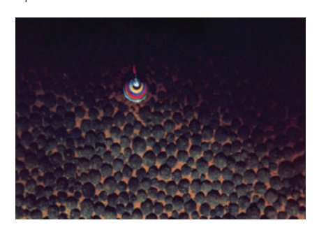
Figure 6. Nodules sampled from the Cook Islands.

analysed for various metallic elements, including Rare Earth Elements. Dr Jim Hein of USGS, an internationally-acclaimed deep sea mineral expert geologist, personally examined and selected 26 manganese nodule samples that were collected during the 1976, 1978 and 1980 surveys. These nodule samples were packed and sent to the USGS in Santa Cruz for analysis by Dr. Hein, which also provided a training opportunity for the Project-sponsored Cook Island official.