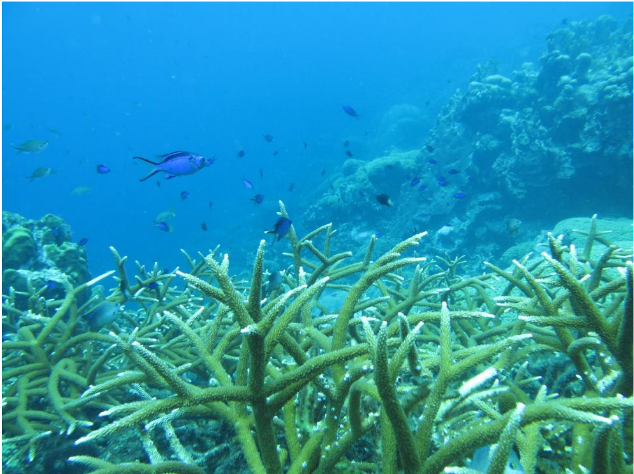
Staghorn coral, Curaçao.