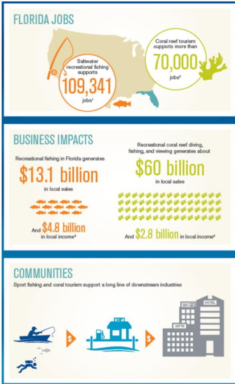
Figure 2: Ocean acidification could affect Florida jobs and the economy. 1 Fisheries economics of the United States 2012. 2 Johns, G.M., et al. 2001. Socioeconomic Study of Reefs in Southeast Florida. Hazen and Sawyer, Final report for Broward, Palm Beach, Miami-Dade and Monroe Counties, Florida Fish and Wildlife Conservation Commission and National Oceanic and Atmospheric Administration; Hazen and Sawyer, 2004. Socioeconomic Study of reefs in Martin County, Florida. Final Report. 120 pp. 3 Fisheries economics of the United States 2012. 4 Values from Johns et al. for 2000 and from Hazen and Sawyer for 2003 adjusted to 2014 dollars and summed.

Economic revenues depend on a host of factors external to the marine ecosystem services in question that are difficult to predict. But because many human communities currently depend heavily on marine benefits, it is reasonable to expect that any changes in marine ecosystem services would strongly affect marine-dependent jobs and income in these communities.