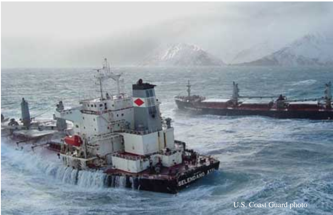
Figure 5. Selendang Ayu after breaking in half off Unalaska Island—stern section in foreground, bow section in background. (Photo taken December 9, 2004, day after accident.)

At 1913, with the master of the Selendang Ayu and Coast Guard rescue swimmer still awaiting rescue, the freighter broke in half on the rocks (figure 5). At 2035, the Alex Haley 's HH-65 Dolphin helicopter returned and rescued the master and the Coast Guard swimmer. After sweeping the shoreline for survivors, the Dolphin flew back to Dutch Harbor, where the Selendang Ayu master and the rescue swimmer were treated for exposure. On December 11, the Alex Haley docked in Dutch Harbor, bringing with it the nine Selendang Ayu crewmembers who had been rescued in the first helicopter evacuation.