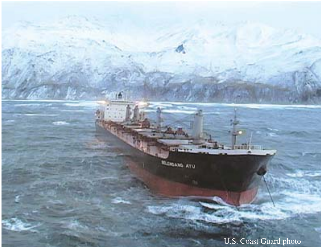
Figure 3. Selendang Ayu off shore of Unalaska Island. Both anchor chains are out and deck lights are visibly illuminated, showing that ship's generators are still producing power.

At 1431, the Selendang Ayu master lowered his starboard anchor. The anchor held with 10 shots on the winch. The Alex Haley's deck log reports that at 1450, the vessel was about 1 mile from the beach, holding to two anchors with 10 shots of chain on each (figure 3).