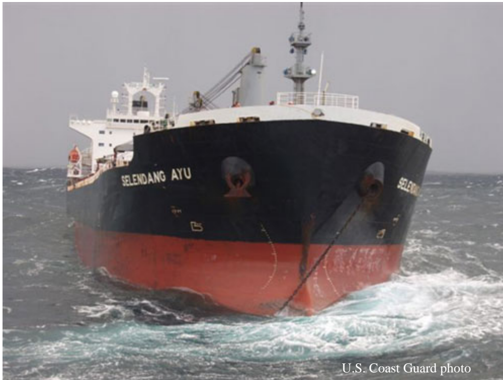
Figure 2. Selendang Ayu drifting with port anchor chain wrapped tightly around the stem.

The distance between the vessels did not allow enough slack for the Selendang Ayu crew to pull in the messenger. The Alex Haley decreased its forward motion while continuing to pay out the messenger. The decrease in speed caused the cutter to lose steerageway and turn to starboard, putting the seas on its port beam. The two vessels were now starboard bow to starboard bow and lying beam to the seas. At 1342, with the tension increased, the messenger line parted. When the Alex Haley bridge received word that the line had parted, the commanding officer ordered the remaining line on the stern to be cut away so it would not foul the propellers.