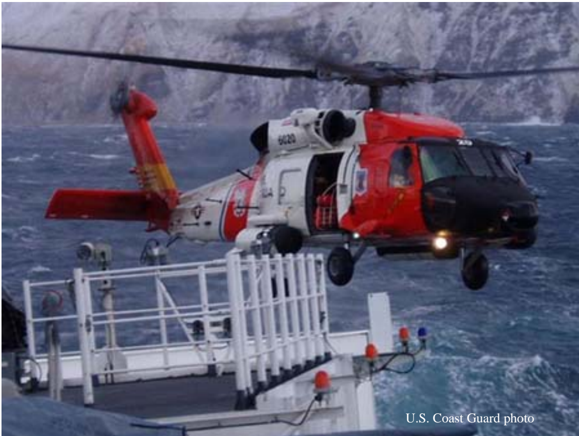
Figure 4. Coast Guard HH-60 Jayhawk helicopter hovering above Alex Haley 's deck during rescue of Selendang Ayu crew.

At 1450, the first HH-60 helicopter completed its hoist and flew the nine Selendang Ayu crewmembers to the Alex Haley . Hovering above the cutter's deck (figure 4), the helicopter lowered the crewmembers one at a time in a basket.